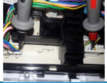
PICTURE E8-3: AC voltage is being measured over valve connectors (KN6 - KN3)

we put a lot of work into all our information so please subscribe to the Channel